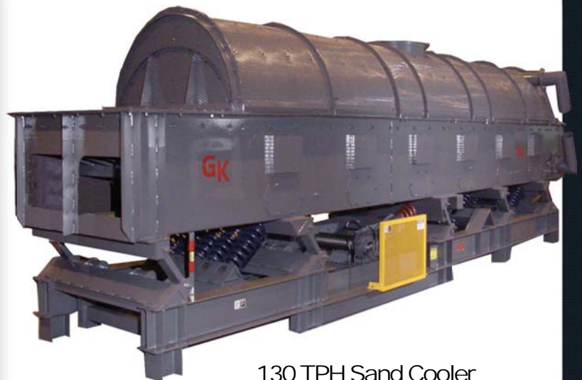
130 TPH Sand Cooler