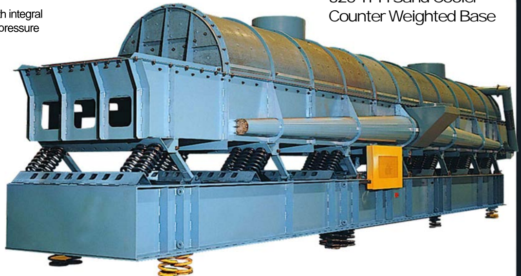
320 TPH Sand Cooler Counter Weighted Base