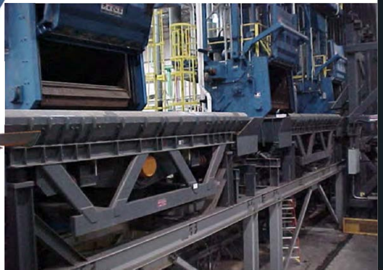
Two-Way Shot Blast Unload