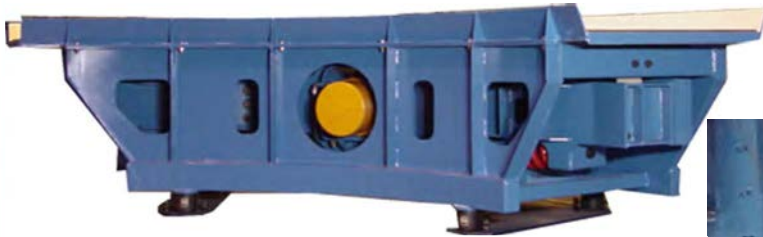
90 Degree Curve Two-Way Feeder