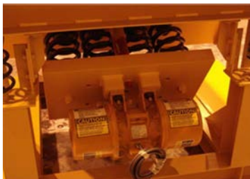
PARAMOUNT II™ Two-Mass Drive