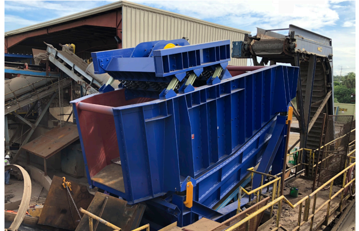
HEAVY-DUTY ROD DECK SCREENS FOR SPECIALTY MATERIAL SEPARATION